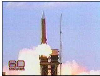
Weapons experts say problems with the Patriot missile system were not fixed before the weapon was deployed in Iraq.